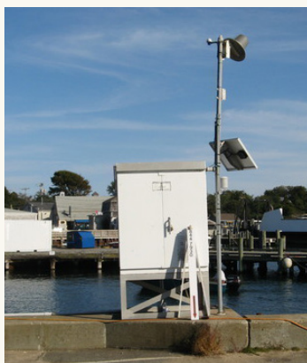
A tide station at Woods Hole, Massachusetts.

NTDE data is provided by water level stations that make up the National Water Level Observation Network (NWLON). While all NWLON stations provide some data, not all have data that span the 19-year period needed for NTDE. To account for this, CO-OPS relies on control (tide/water level) stations to infer what a 19-year average would look like at non-control stations. CO-OPS refers to this as a 19-year NTDE equivalent datum. This allows all tidal datums to incorporate data from the same epoch, even if actual observations come from another time period - which ensures that NOAA's tidal datums are compared to one another in a meaningful way!